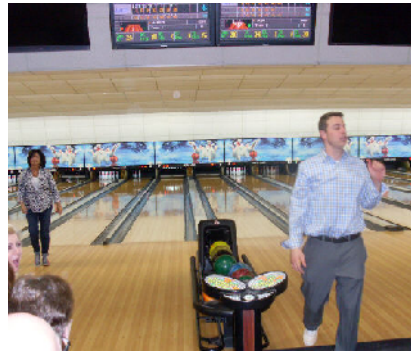
Nonprofit Seminar - Working with Millennials

To check the status of MODC activities which may be affected by inclement weather conditions log on to www.wobm.com , www.943thepoint.com , and type NJ Stormwatch in the "search" box to obtain up-to-date information.