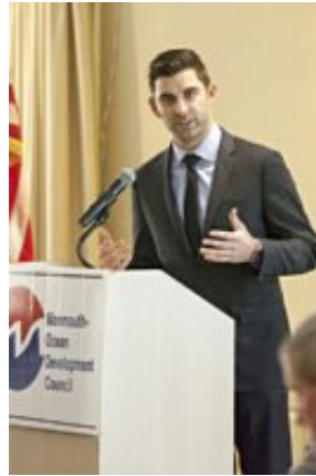
Annual Silver Gull Awards Dinner